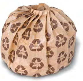
Stock Print on Kraft