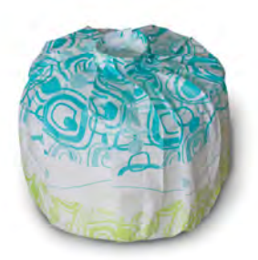
Stock Print on White