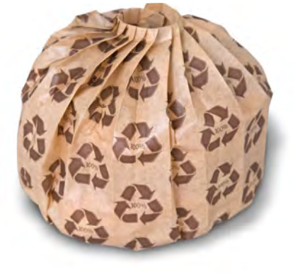
The PleatPak™ for Sandwiches