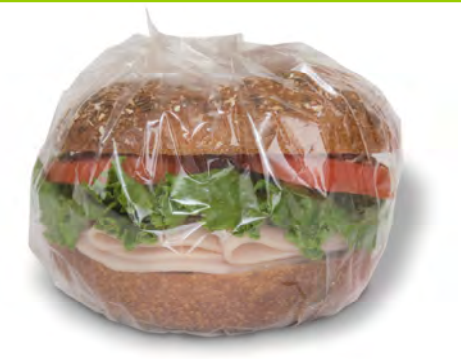
Made with biodegradable cellophane or 100% recycled paper